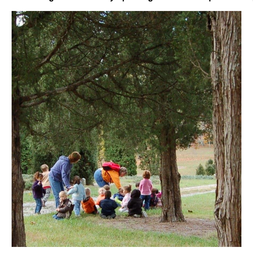
Preschoolers enjoy the woods of the Arboretum